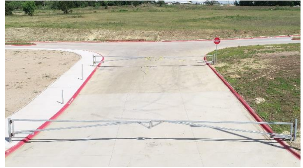
Installing Site Gates