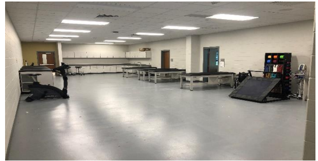
Installing Training Room Equipment