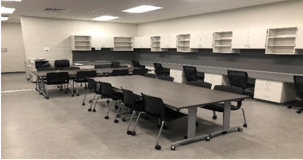
Installing Furniture in Area M