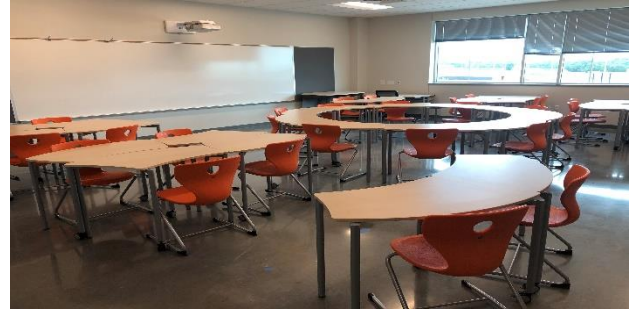
Installing Classroom Furniture in Level 3