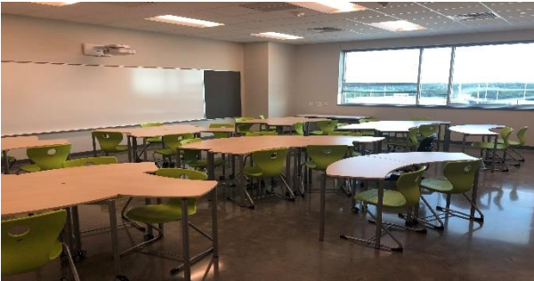
Installing Classroom Furniture in Level 2