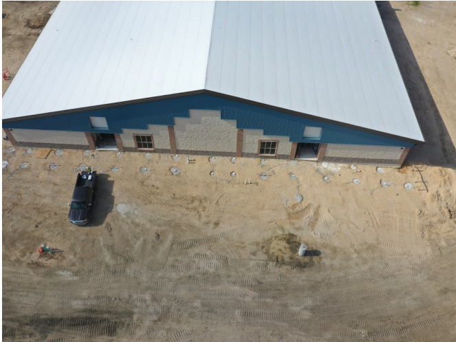
Canopy Piers Poured North Elevation Area A