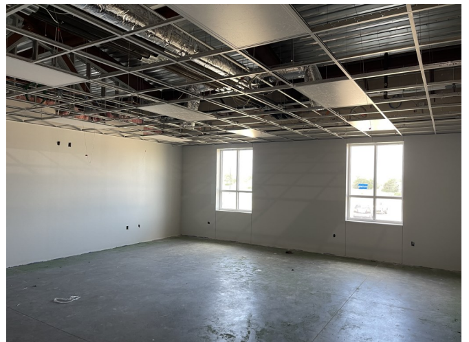
Ceiling Grid/ Light Fixtures Area A