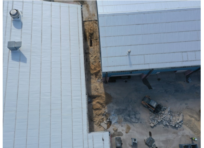
Concrete Demo/ Grading Area C Corridor