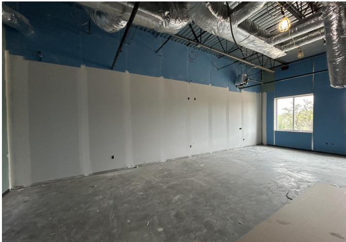
Tape and Float at Level 2 Areas A and B