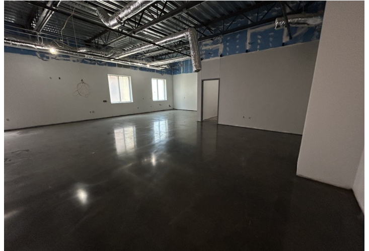
Interior Paint at Level 1 Areas A, B, and C