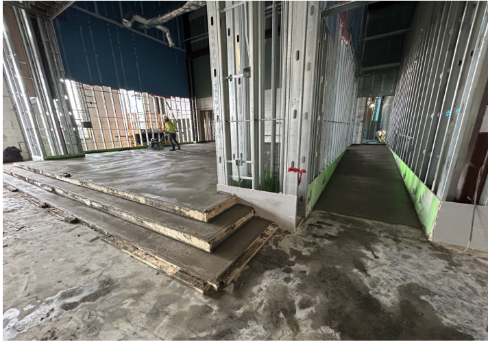
Concrete Pour at Stage and Ramp