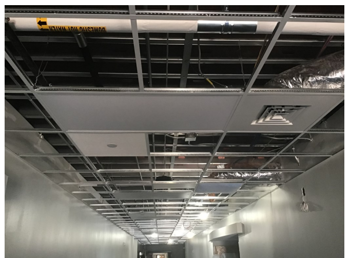
Diffusers Area A