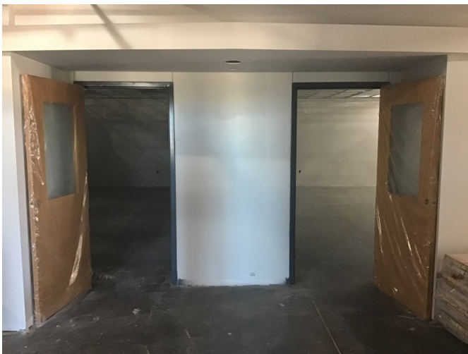
Wood Doors Area A