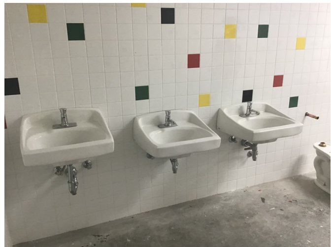
Plumbing Fixtures Area A