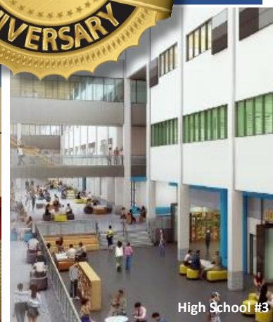
High School #3